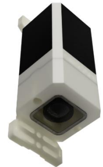
Forward facing option also available

Compared to our existing Time-Lapse Camera models, the incredible High Quality (HQ) Camera module offers a higher resolution (12 megapixels, compared to 5 megapixels) and the ability to record image bursts of up to 10 images at a user-defined framerate. Especially when the time-lapse imagery is used as input for operational computer vision algorithms, the superior image quality of the HQ Camera is to be preferred.